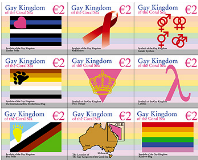
Figure 7 - Stamps issued by the Gay and Lesbian Kingdom