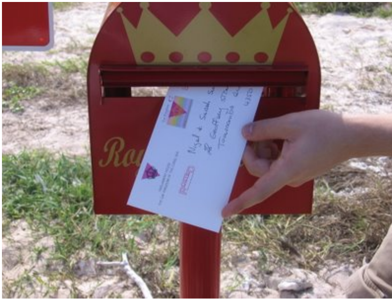
Figure 6 - A letter is formally posted from the Kingdom