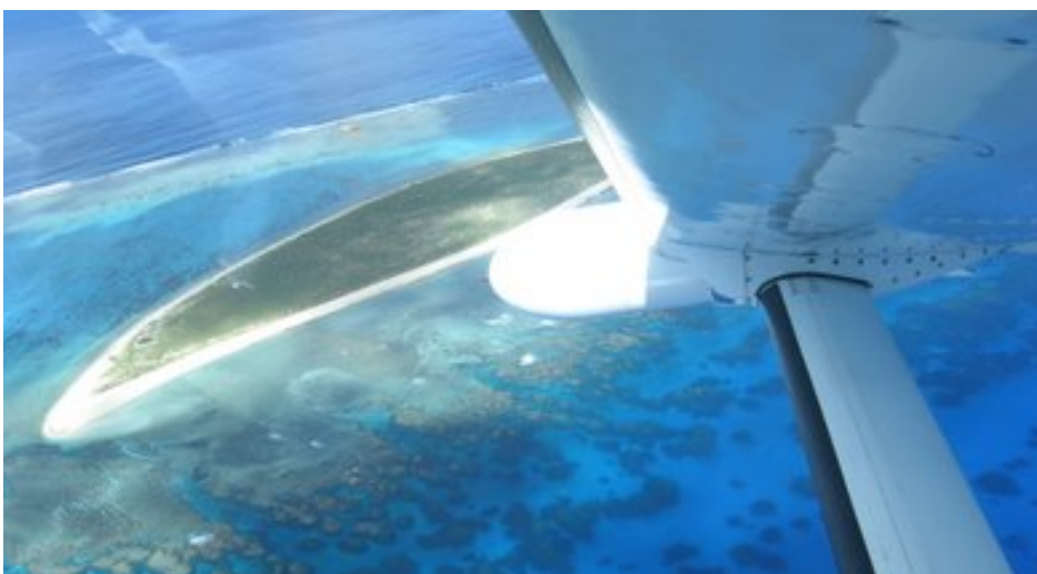
Figure 2 - View of Cato Island from the seaplane upon landing

This is the kind of queer sovereignty that I have in mind, and that can be seen in footage taken by the G&LK of its landing on Cato Island. The footage consists of still photographs which give way to a live recording of the 2004 visit to Cato by seaplane (accompanied by the fantastic music of Handel's 'Zadok the Priest': "God save the king/Long live the king/May the king live forever/Amen, amen, alleluia, alleluia, amen, amen"). Some of the images on its website are reproduced below. 10 One might notice, for example, the sense of playing for an audience, or for history, that is part of this chronicle, in its faithful recording of the formalities and ceremonial drama of a nationalist claim. These include the journey over sea, the stepping upon consecrated soil, the flag raising, the reading of the plaque inscription, and so on.