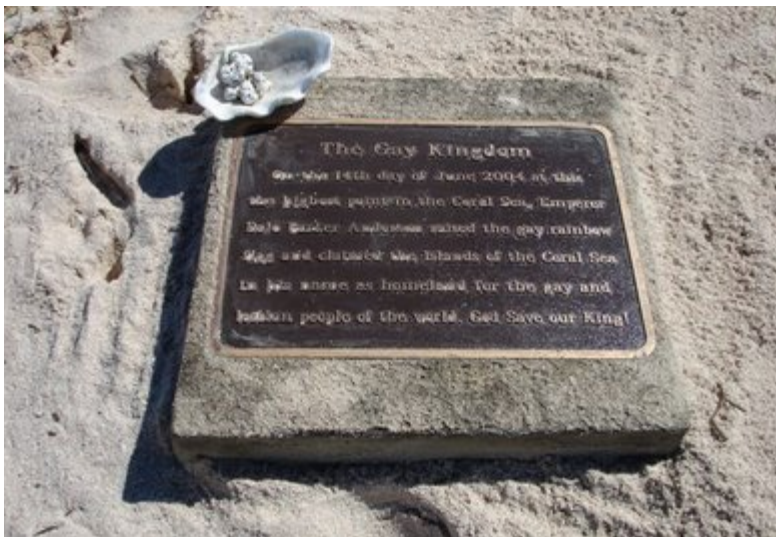
Figure 5 - The Gay and Lesbian Kingdom plaque is laid to commemorate the declaration

At one point in the video, footage the approach switches from a home-movie style of recording - complete with family commentary - to a news reporter voiceover ('This is so-and-so, on location at Cato Island'). The narration is self-conscious and staged, imagining and so claiming its place in the nationalist archive. It is in the assumption of the protocols of nationalist assertion that its sovereign gesture is 'queered'. Emperor Dale enacts or performs the inauguration of sovereignty, that is, but he does it in a way that doubles and displaces it, opening it a reproduction, or to a recreation, that is at odds with its conventional operation.